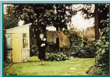
Nyna's Grandmother in her Oakland garden