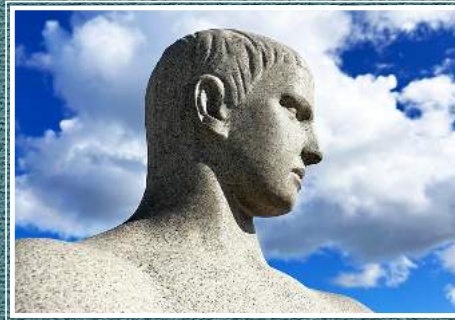
Handsome gent in Oslo