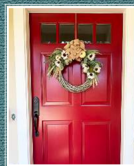
Suellen Rottiers's Thanksgiving Decor