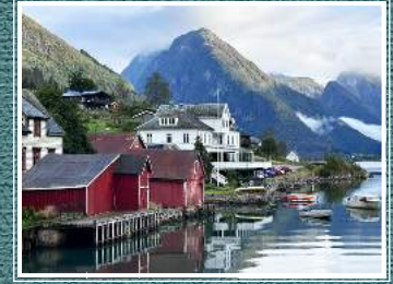
Norwegian fjord town