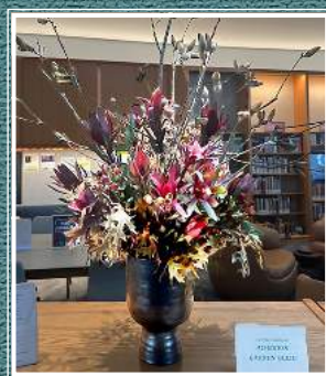
Carol Selig's Library Flowers